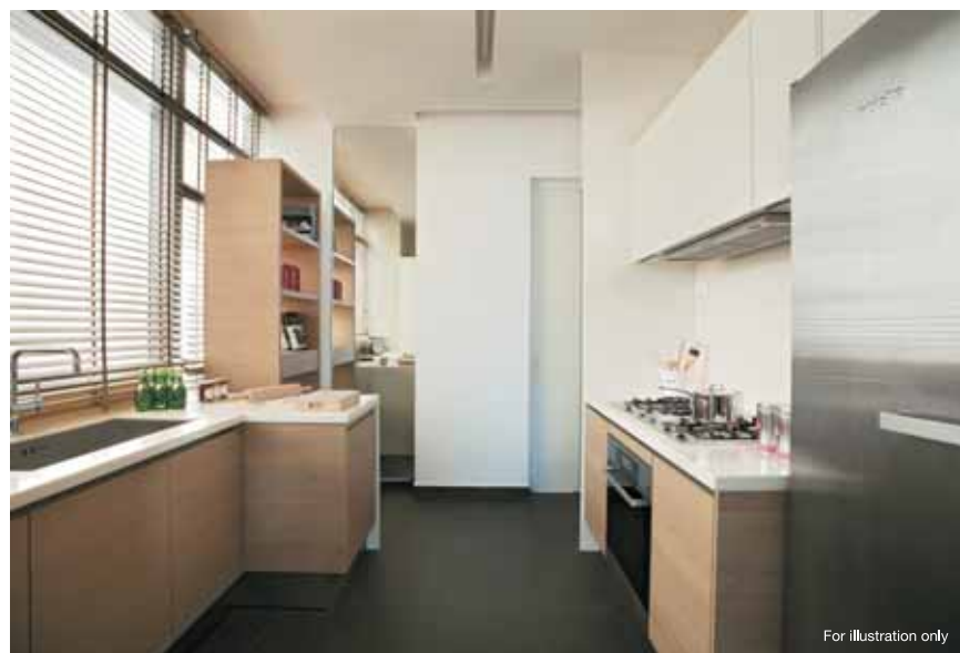
Kitchen – Fully equipped to impress with inspiring culinary creations