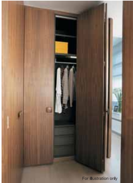
Walk-in Wardrobe* – With luxuriant space for your designer collection, it is like stepping into your private fashion gallery.