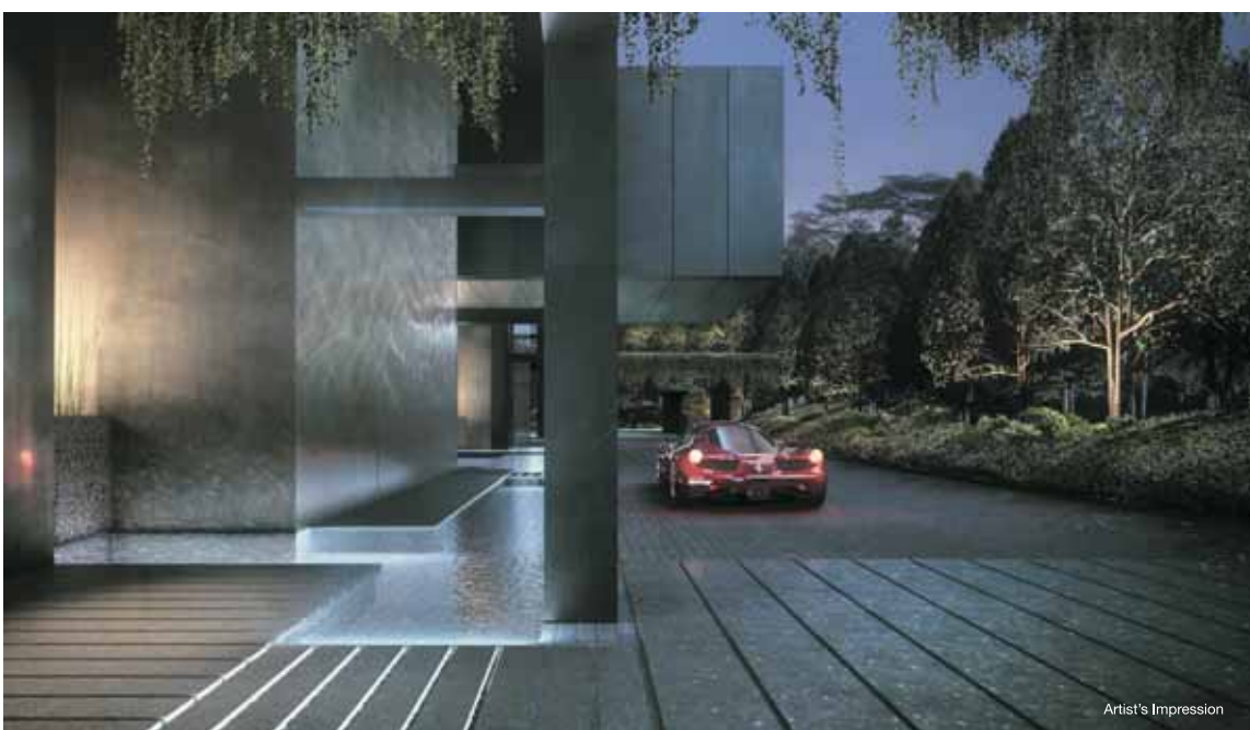
The Arrival Lobby – Be welcomed by a vista of sophisticated elegance and understated grandeur as you arrive home to accustomed luxury