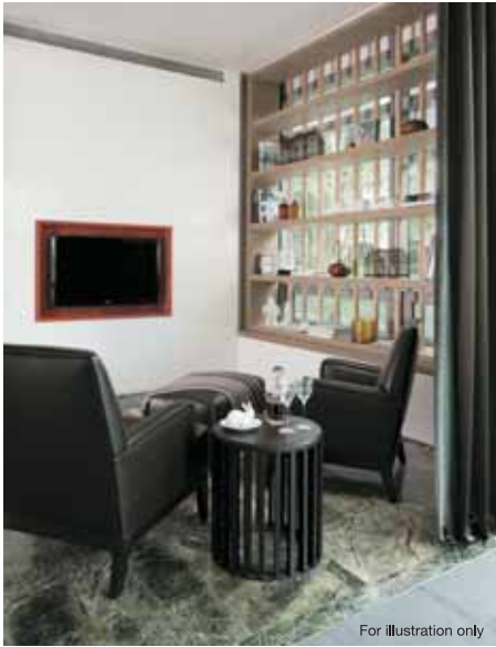
Family/Study Room – Enjoy the freedom to transform this into a conducive area for a study, a library or even an entertainment room with your very own theater