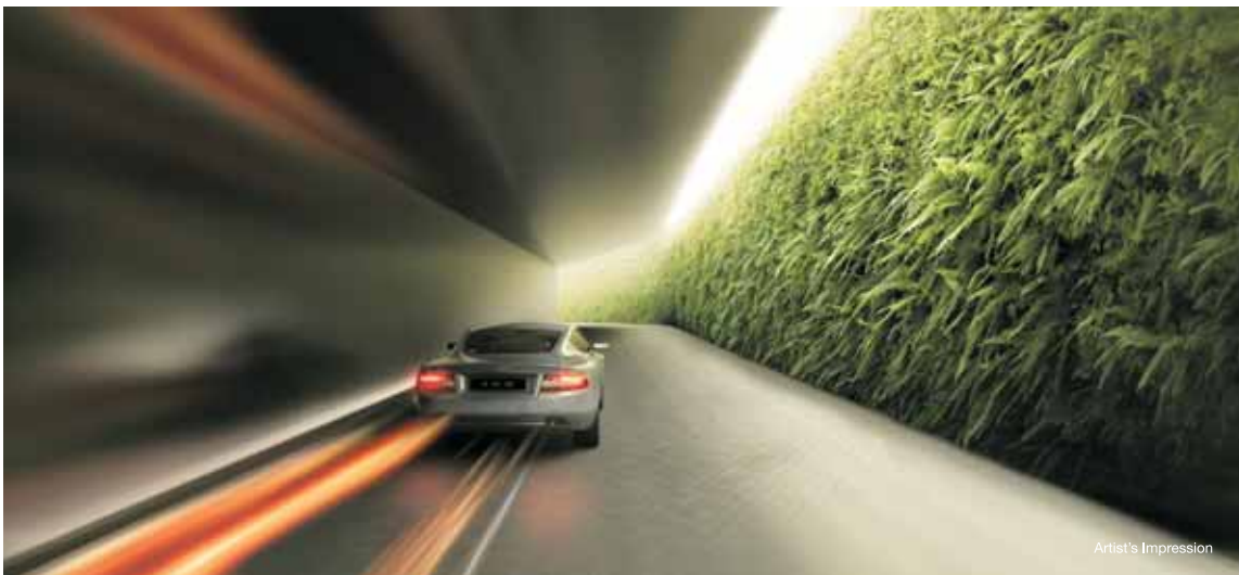
The Gateway Boulevard – The buzz of city life dissipates the moment you drive through the dramatic driveway lit by a linear strip of natural lighting

In the prime and lush Ardmore and Anderson enclaves, the main tower showcases a network of vertical greenery amidst a striking facade. The masterful arrangement of complementary tones of glass, creates an ever-changing palette from every different angle. The elegant beauty of the singular square tower is also further enhanced by having all four frontages distinctively unique, making Nouvel 18 a true architecture masterpiece.