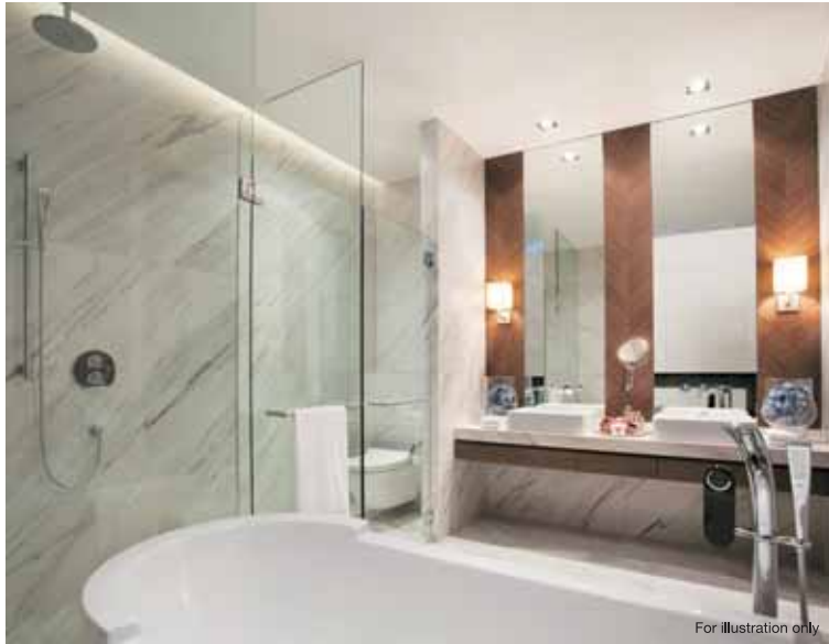
Master Bathroom – Soak in the attention to detail, right down to the superior fittings from Grohe and Duravit