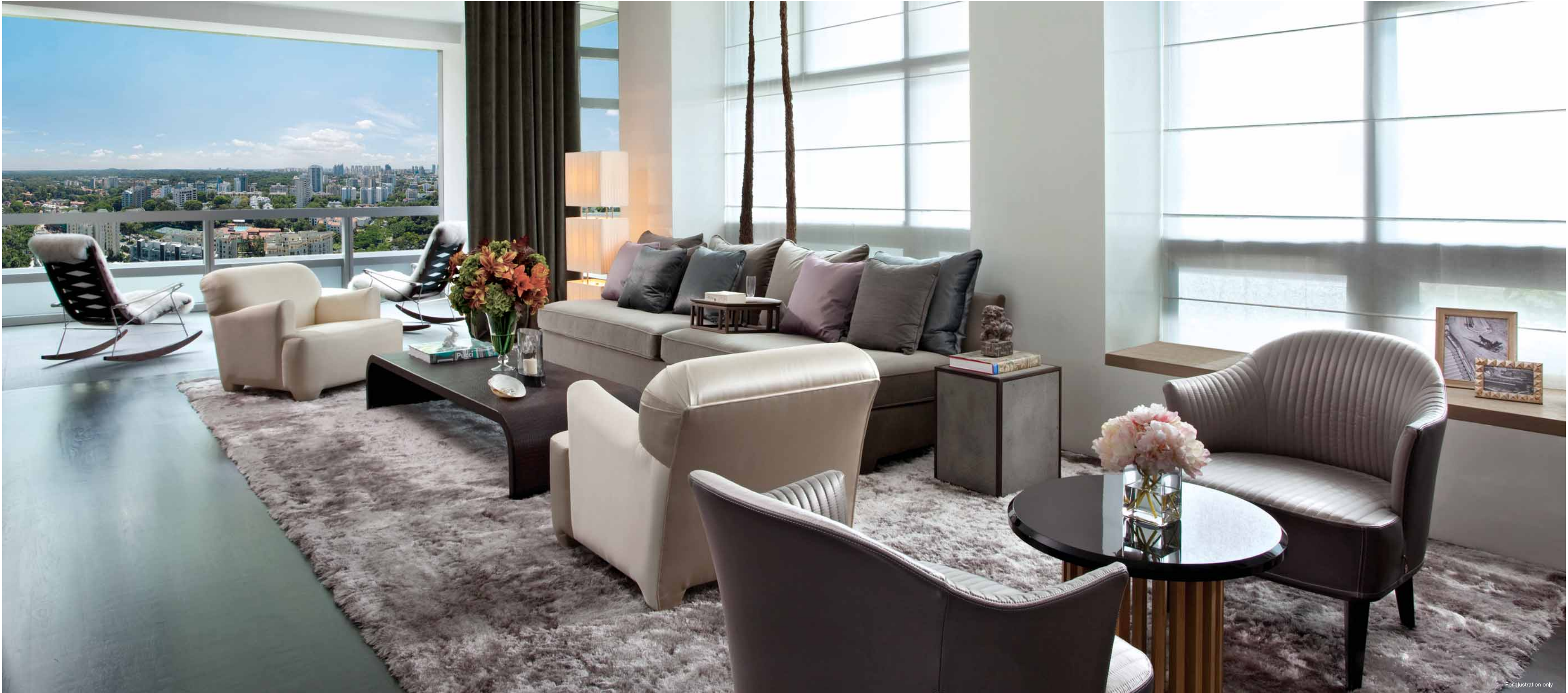
Living Room – Lavishly spacious and defined by meticulous design