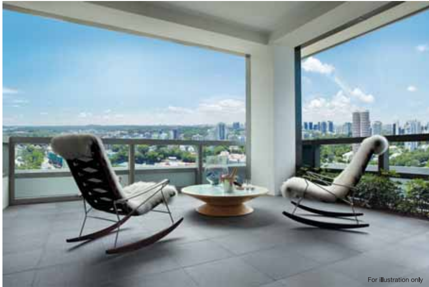
Private Balcony – The perfect place to revel in the evening tranquillity with the sparkling city skyline as your backdrop