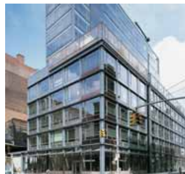
40 MERCER ST RESIDENCES - New York, USA