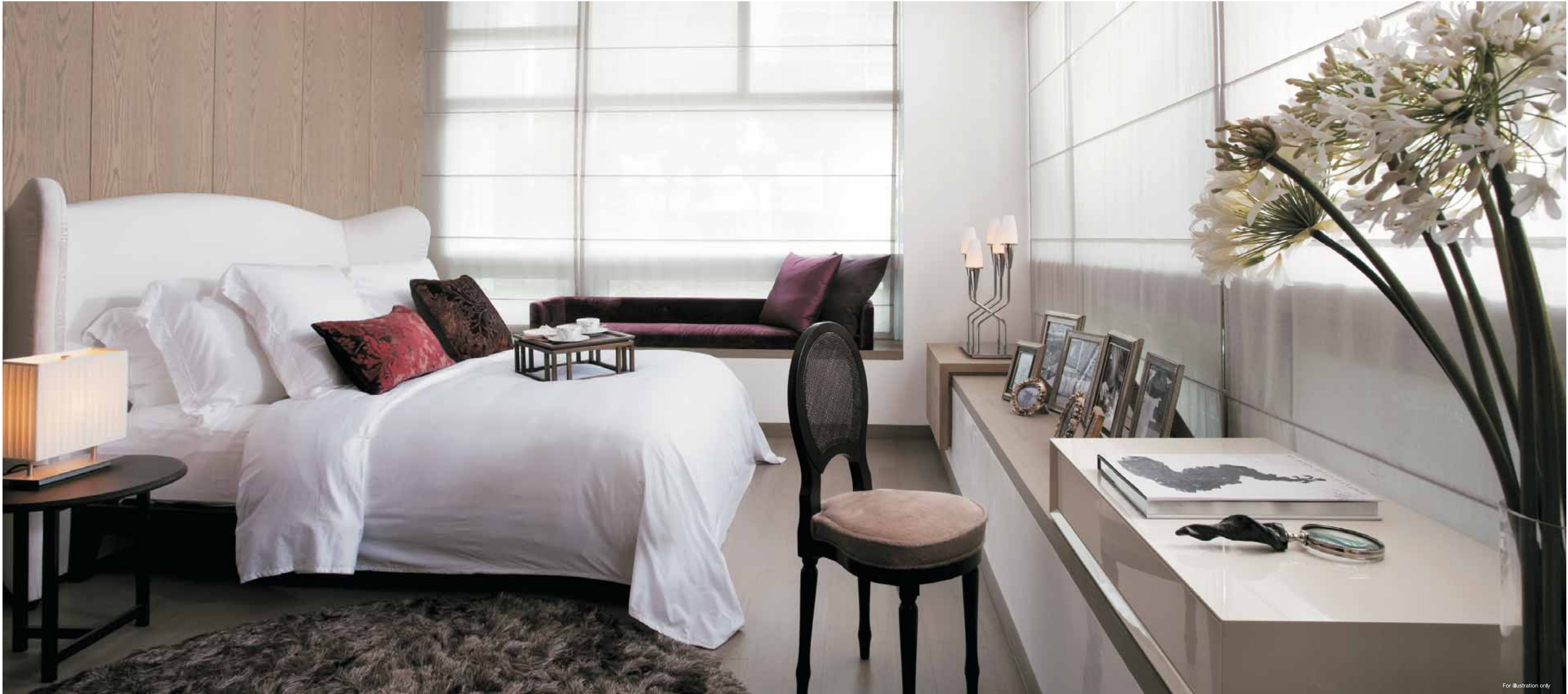
Master Bedroom— Enjoy total privacy and exclusivity in this large personal living space