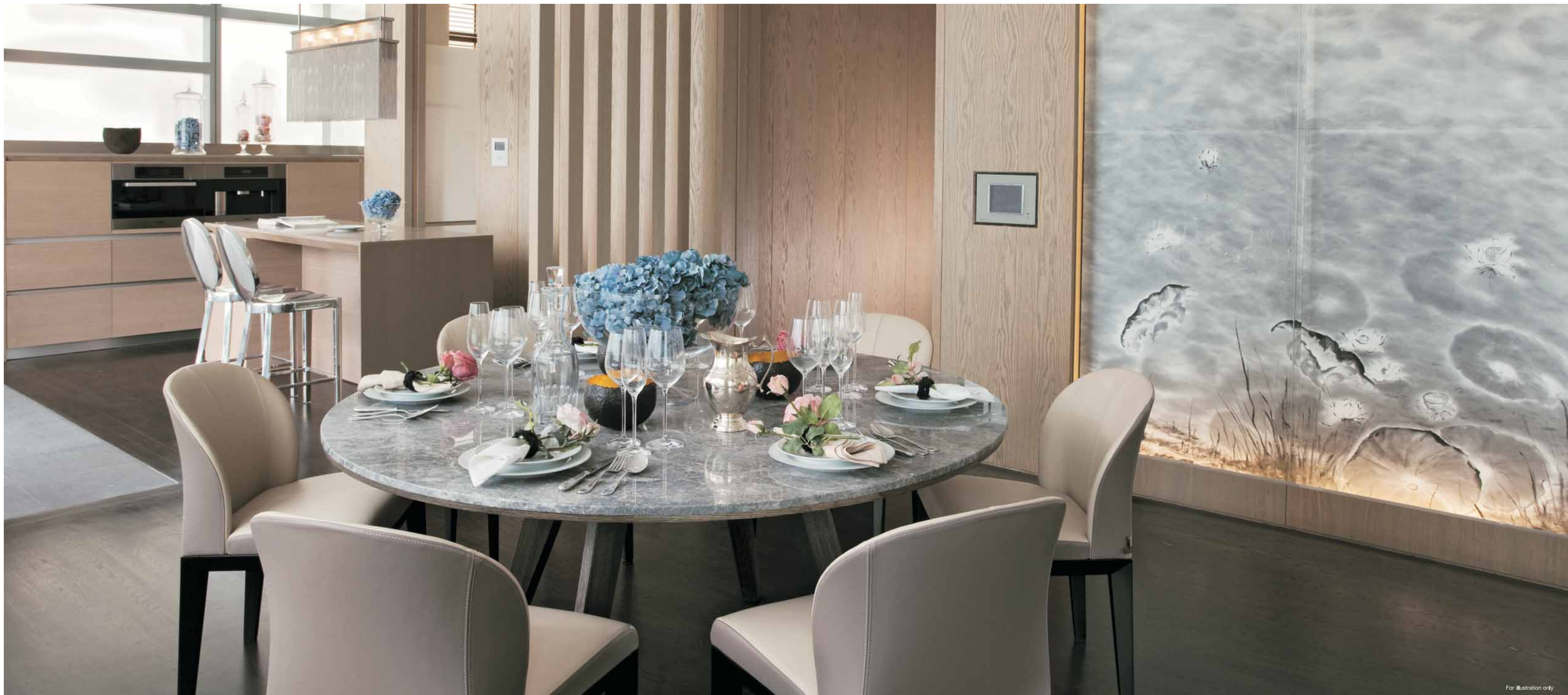
Dining Room – A vast space to entertain, wine and dine in style