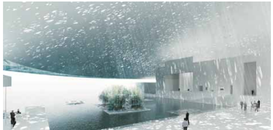
LE LOUVRE - Abu Dhabi